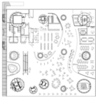
Linear – Sendai Mediateque, Toyo Ito, 2001

Analysis of 12 canonical examples of modern architecture.