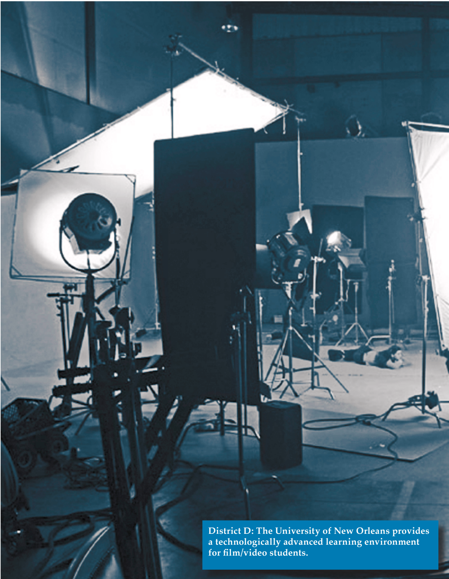
District D: The University of New Orleans provides a technologically advanced learning environment for film/video students.