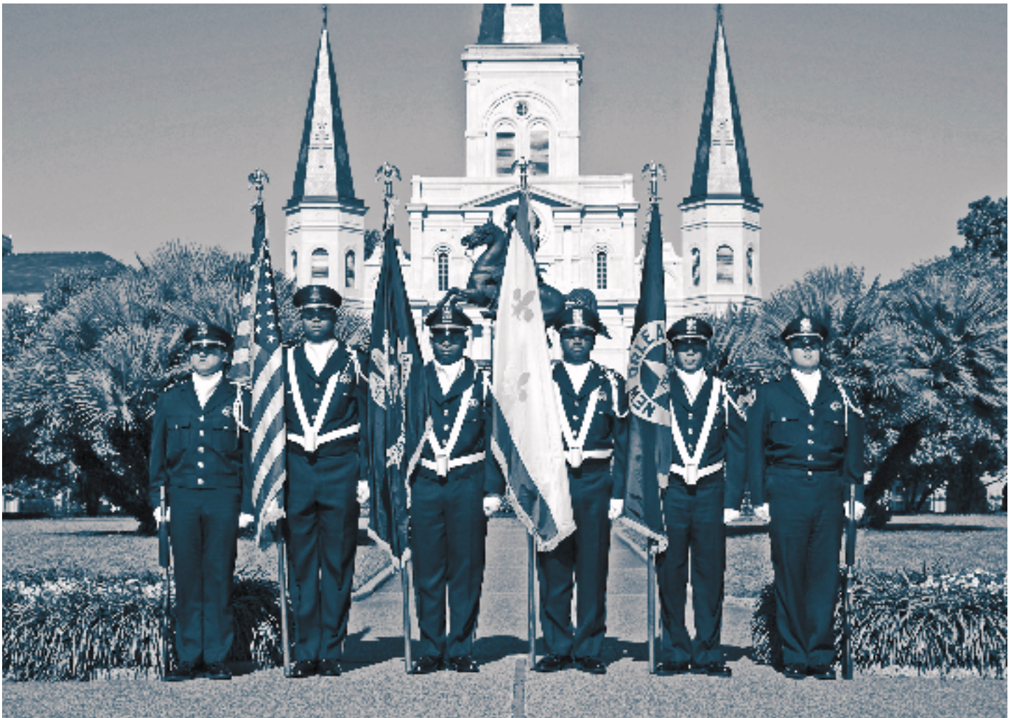
New Orleans Police Department Honor Guard.

Recognizing the critical nature of the first minutes following a heart attack, the Council ordered Automatic External Defibrillators for City Hall ( Motion M-04-485 ).