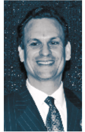
Jefferson Parish Councilmember-At-Large John Young

Strongly opposing a proposed water park on state land next to Zephyr Field in Metairie, the Council requested that Jefferson Parish and state officials delay action until a regional discussion on the project's feasibility was convened ( Resolution R-04-572 ). Citing the fact that there are five water parks within 90 minutes of New Orleans, the Council questioned whether the Greater New Orleans area could support this water park, in addition to one planned by Six Flags New Orleans in District E. The Council's opposition led to the abandonment of the project by Jefferson Parish and state officials, in support of the planned development at Six Flags New Orleans.