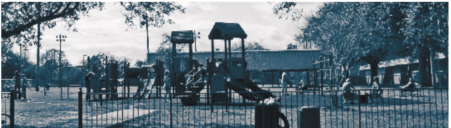
NORD's Norman Playground in Algiers, District C.

At the request of the Council, a Los Angeles firm that designs sets for television newscasts has developed a plan for the renovation of the Council Chamber, to be funded by the 2004 bond issue.