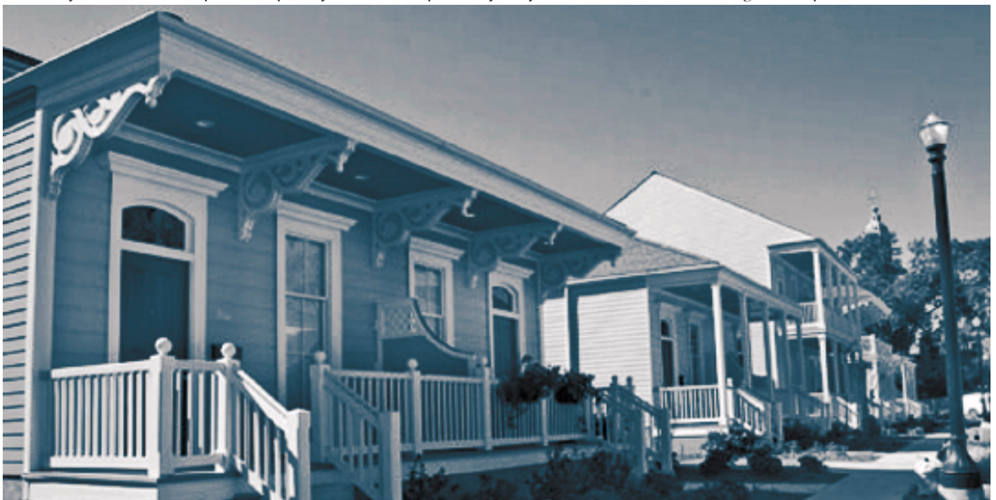
Phase I of River Garden opened as part of the redevelopment of the former St. Thomas Housing Development in District B.

A temporary moratorium prohibiting the issuance of permits by any city department for new construction or expansion of multi-family dwellings containing two or more units was extended until April 26, 2005, in District D and until April 11, 2005, for the Lower Ninth Ward in District E ( Ordinance Nos. 21,702 and 21,705 M.C.S. ).