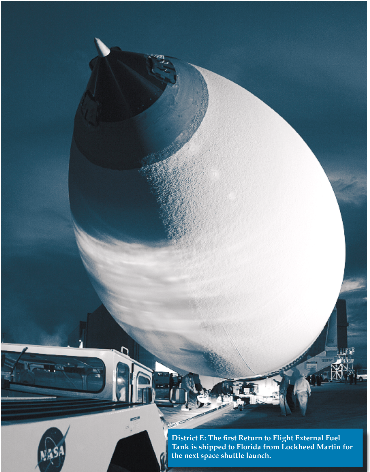
District E: The first Return to Flight External Fuel Tank is shipped to Florida from Lockheed Martin for the next space shuttle launch.