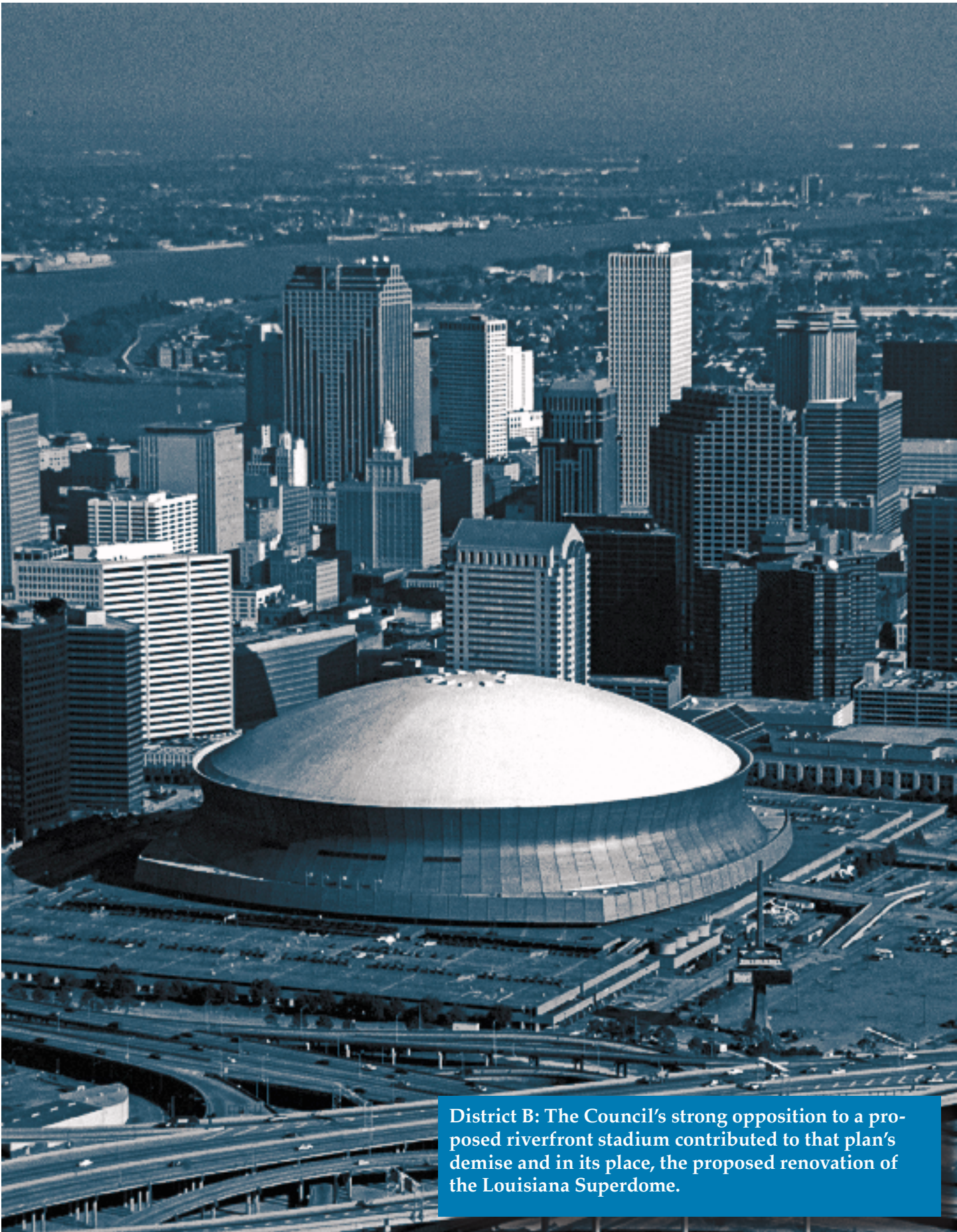
District B: The Council's strong opposition to a proposed riverfront stadium contributed to that plan's demise and in its place, the proposed renovation of the Louisiana Superdome.