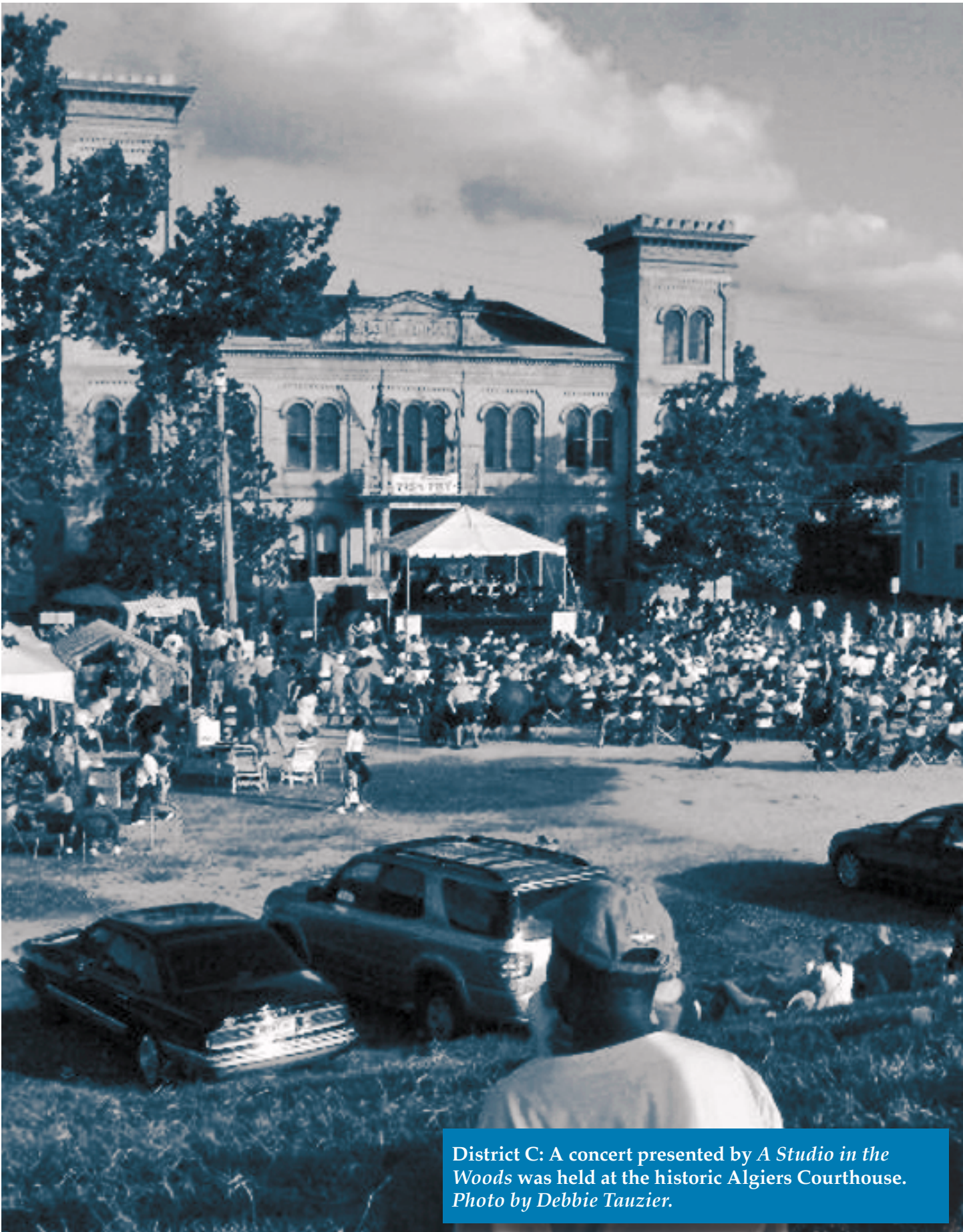
District C: A concert presented by A Studio in the Woods was held at the historic Algiers Courthouse.