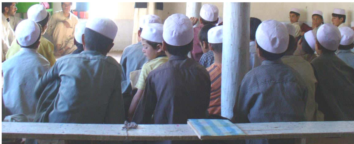
A lesson begins for boys at a Qur'anic school in Panjshir.