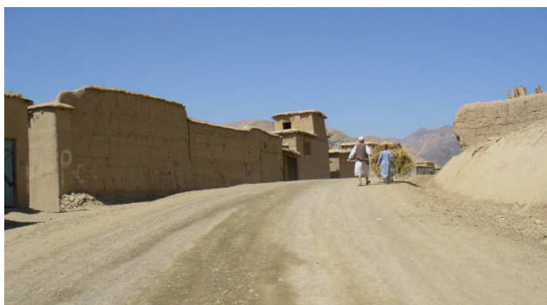
The main, and only, road that traverses the Panjshir Valley.

Qualitative interviews were more complicated to carry out than the researchers anticipated. Societal limitations on Afghan girls, especially those living in rural areas, mean they usually cannot be tape recorded. Adolescents are not accustomed to speaking to strangers, nor are they accustomed to sharing their views or opinions. Responses tended to be short and circumspect. Still, these interviews were useful for gaining a more detailed view of children's daily activities (work, how time is spent with family members and/or friends), children's fears, hopes, and the level of violence at home, or in school.