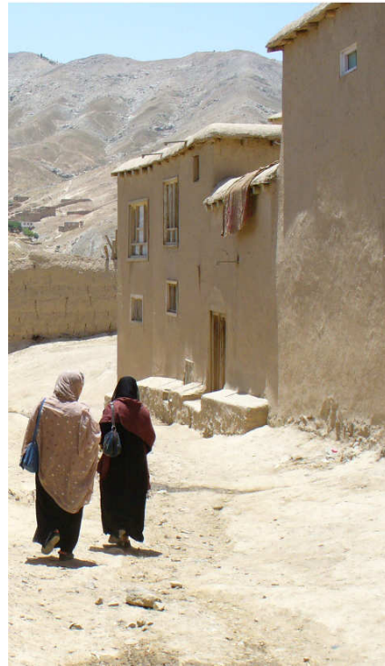
The village of Onaba in the Panjshir Valley where the pilot study and uptake study were conducted.

references to keeping conversations private may raise suspicions about inappropriate behavior (otherwise why would confidentiality be necessary). Study supporters (teachers, mullahs, government administrators) commented on Western attempts to brainwash Afghans, to convert Muslims to Christianity, 10 or to weaken madrassas by cutting off funds and replacing them with NGO schools. Some asked who was behind the study, and if the PI was “sympathetic to the Afghan nation.”