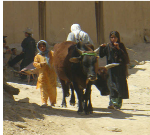
22 of the 49 adolescents interviewed said they herded animals as unpaid labor.

launched a door-to-door survey with the 20-question questionnaire. A total of 181 households in three villages in Panjshir province were surveyed for the uptake study.