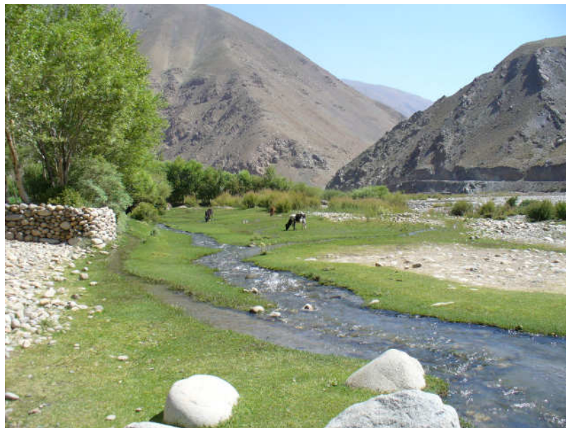
One of the villages in Panjshir Valley visited by the research team.