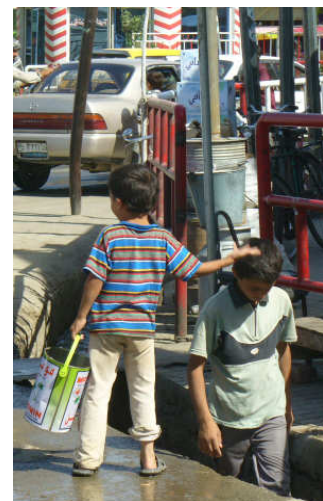
Two boys wash cars with water from the open drainage system in Charikar, just north of Kabul.

The achievement tests for math and Dari were also critical instruments designed for the study. No national achievement tests existed at the time in Afghanistan. Teachers created their own handwritten exams that the head teacher approved and the teacher administered. Scores were sometimes compiled for the school, but there was no central database where nationwide scores were maintained. The PI and research assistant worked with the CRS education staff to design the math and Dari exams.