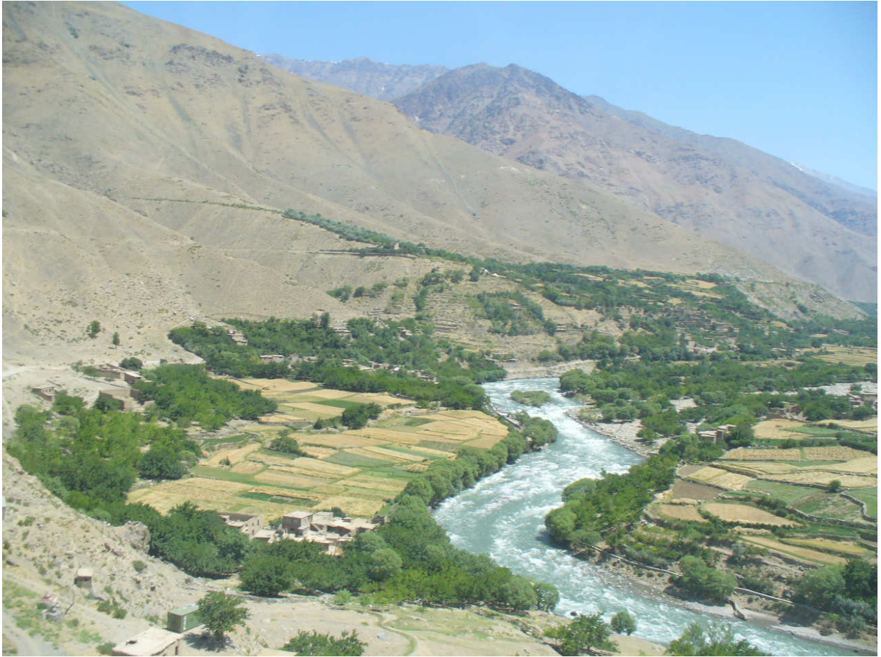
Panjshir Valley, Afghanistan