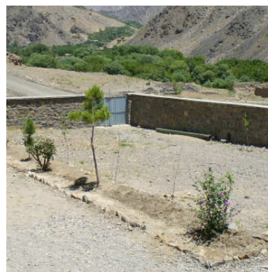
The playground of a government school visited for this study.

Of the adolescents surveyed, girls are more likely than boys to express that they are “always” or “sometimes” afraid of the situations listed above in all four settings, except the government school class, where boys expressed slightly more fear than girls. Thirteen of 24 girls reported that they were “always” afraid of being hurt at home, and two reported “sometimes”; these responses were evenly distributed across types of educational settings. Nine boys reported “always” in response to this question, and seven reported “sometimes,” of the 25 boys asked. Although boys reported being beaten at school in side conversations and in qualitative interviews, it did not seem to factor into their fear of being hurt at school. Eighteen of 19 boys enrolled in the three types of schools responded that they were “never” afraid of being hurt at school. Ten of 18 girls interviewed responded “never” to the same question, five said “always,” with equal distribution across the three school settings.