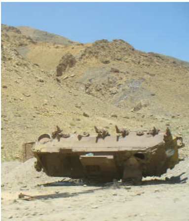
Remnants of past conflict litter Panjshir and offer a constant reminder of the valley's history.

Autonomy among individuals, especially children, in Afghan society is not stressed the way it is in many western countries. The researchers were continually faced with surprise when children's opinions are sought. This did not vary significantly across educational settings. If anything, the students attending the madrassa seemed to have the most composure and confidence in speaking, but this could be related to their (likely) higher socio-economic status, and their greater number of years in school.