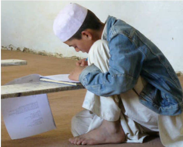
A young boy taking the Dari achievement exam.

Providing education services during humanitarian crises and early reconstruction is emerging as a key element in humanitarian action. Humanitarian agencies view education as a way to protect children from violence, promote child welfare, and enhance stability in communities recovering from conflict and crisis. This increased attention to education in relief work is reflected in the rising numbers of programs, the greater funding available for this