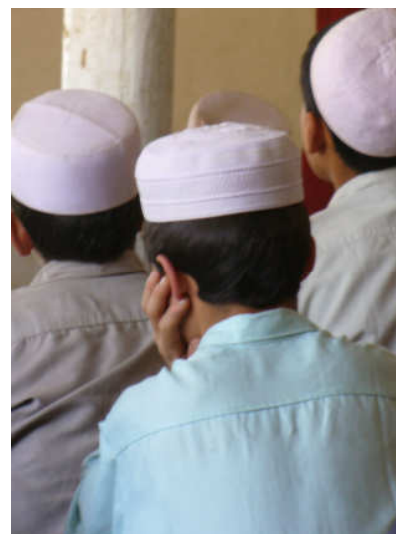
A boys class at a madrassa in Panjshir.

The pilot study has generated great interest among educators, representatives of international agencies, and members of the government. The Columbia researchers and CRS hope to use this momentum to continue to support the education system in Afghanistan.