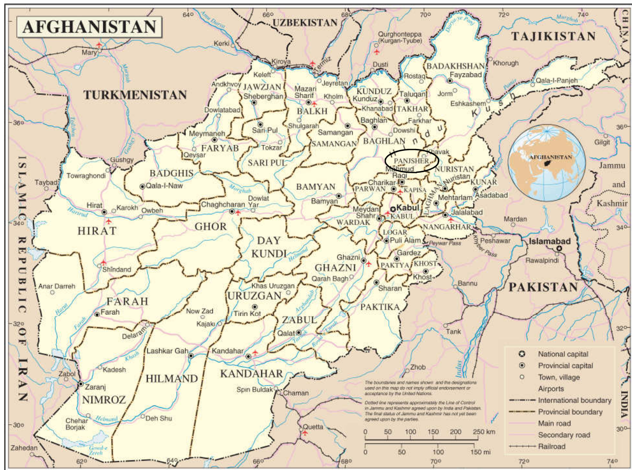
Map No. 3958. Rev. 5. UNITED NATIONS October 2005

Department of Peacekeeping Operations Cartographic Section