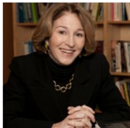
Anne Marie Slaughter

Women in academia are often praised for their accomplishments but not recognized for the tremendous strides they have made as women scholars. As a journal grounded in the experience of women, we aim to promote women in the academic world and to understand their unique experiences.