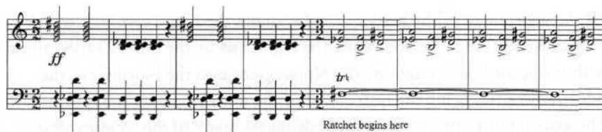
Example 3. Steel Mill Music from The River . Copyright 1958 by Virgil Thomson. All rights for the world exclusively controlled by Southern Music Publishing Co., Inc. Reprinted by permission.

and evil. The image of the steel mill is here meant to represent one of the villains of the film, and the music acts accordingly, providing a synchronous musical track that criticizes the growth of industry linked with the river. If the steel mill were meant to be viewed in a positive light, which is not the case in this film's argument, then this music would be in a contrapuntal relationship to the visual track (this use of the term contrapuntal coming from Eisenstein, Pudovkin, and Alexandrov in their famous "Statement").