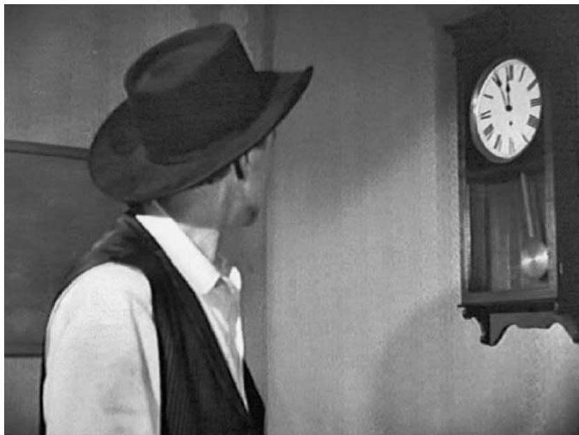
Figure 4. Kane looks at the clock approaching high noon (11:56) in High Noon (1952).

Clock are only one point at which the film loses its sense of containment. The title song also works to blur the boundaries between the diegetic and the nondiegetic, creating a musical anchor in the real world as the audience watches the film. In a famous anecdote, producer Stanley Kramer expressed an intense dislike for the first version of the film, complaining that it was just Gary Cooper walking up and down a street; he was said to have called it “a real stinkeroo.” 32 While there are conflicting reports of which individual made what contributions to the finished product, there is agreement that at this point, after a poor sneak preview, Tiomkin was asked to compose the title song. Lewis Milestone has taken credit for first having the idea of accompanying a film with a sung ballad whose words articulate important parts of the narrative; he reminisces that his use of a ballad in A Walk in the Sun (1945) led Carl Foreman to apologize for stealing Milestone’s idea and reusing it in High Noon . 33 Tiomkin, in his autobiography, suggests that it was he who had the idea to add a theme song and he also says he convinced Kramer “that it might be a good idea to have the song sung, whistled, and played by the orchestra all the way through.” In contrast to Tiomkin’s